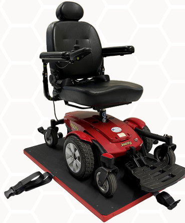
Wheelchair easily located onto PCCP