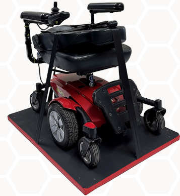
Wheelchair secured to PCCP and ready to be stowed on aircraft

The ATS Power Chair Cargo Protector (PCCP) is a solution for the existing wheelchair embargo faced by Embraer 175 operators, as outlined in FAA SAFO 23003. The PCCP secures to the wheelchair and distributes the weight as shown above.