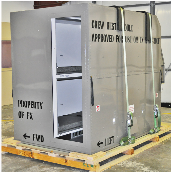
Crew Rest Module

Aviation Technical Services (ATS) specializes in making the MRO process better through reducing span times, increasing mechanic efficiency, improving airline operational performance, and lowering overall costs through maintenance prevention strategies.