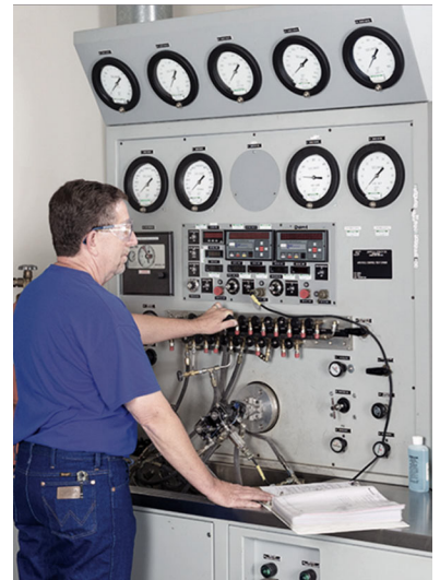
APU Fuel Control Functional Testing