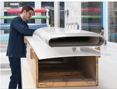
Cabin Air Inlet