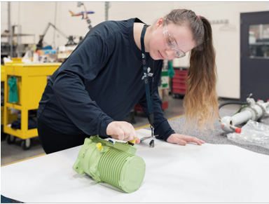
Alt Flap Drive AC Motor

*Individual company tours can be scheduled at any time